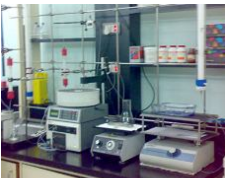
Protein Purification System