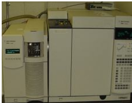
Gas Chromatography with MS