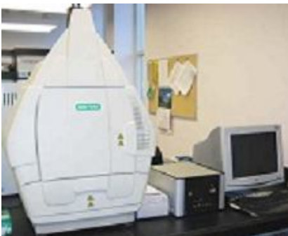
Gel Doc System)