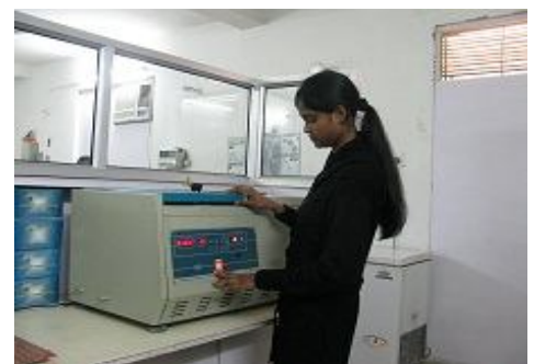
Refrigerated Centrifuge ( 4 Nos)