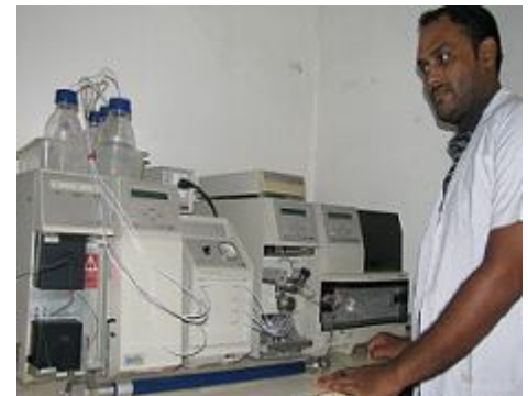
HPLC ( Thermo )