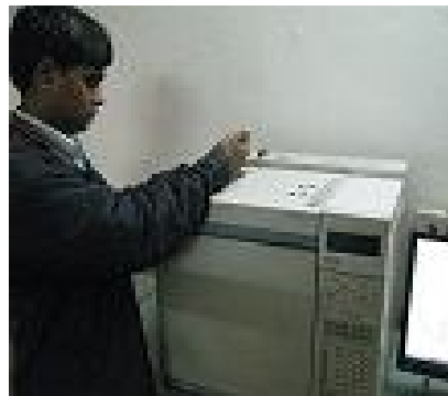
Gas Chromatography ( With FID )