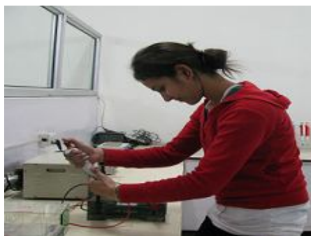
Electrophoresis ( 10 Nos )