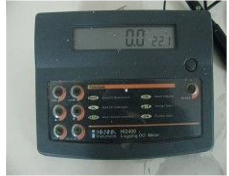
Dissolved Oxygen Meter