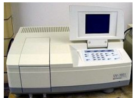
Shimadzu Spectrophotometer ( 2 Nos)