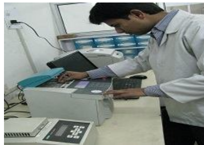
MWG Biotech PCR ( 3 Nos )