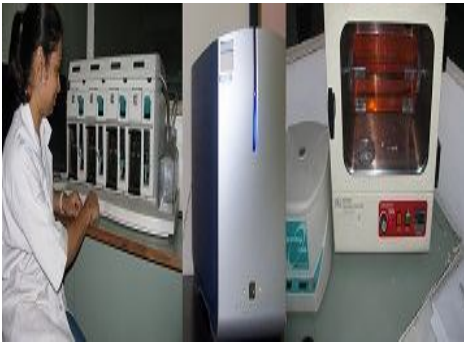
Affymatrix Microarray Facility