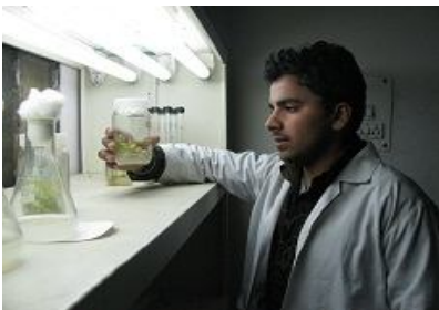
Plant Tissue Culture