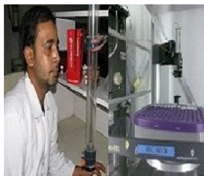
Protein Purification System