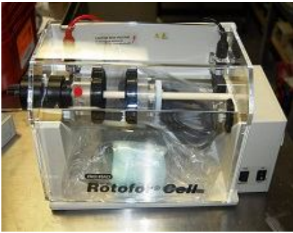
Iso Electric Focusing