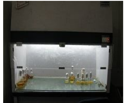
Laminar Air Flow ( 2 Nos )