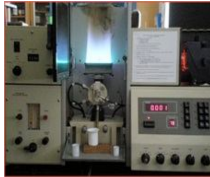
Atomic Absorbance Spectrometer