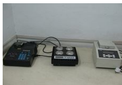
PCR / Gene Cyclers ( 3 Nos )