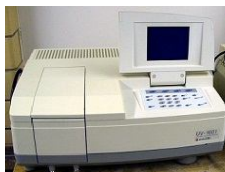
Shimadzu Spectrophotometer ( 2 Nos )