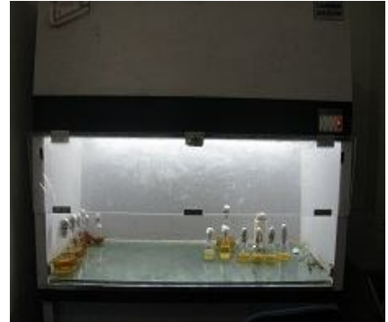
Laminar Air Flow ( 2 Nos )