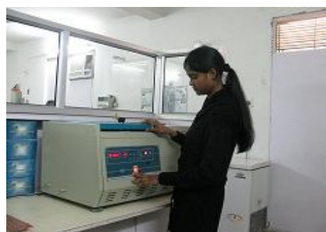
Refrigerated Centrifuge ( 4 Nos )