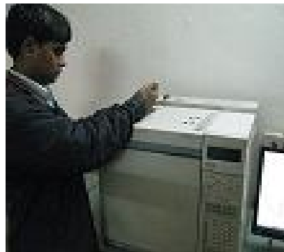
Gas Chromatography ( With FID )