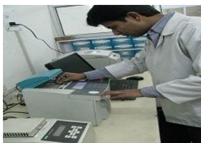
MWG Biotech PCR ( 3 Nos )